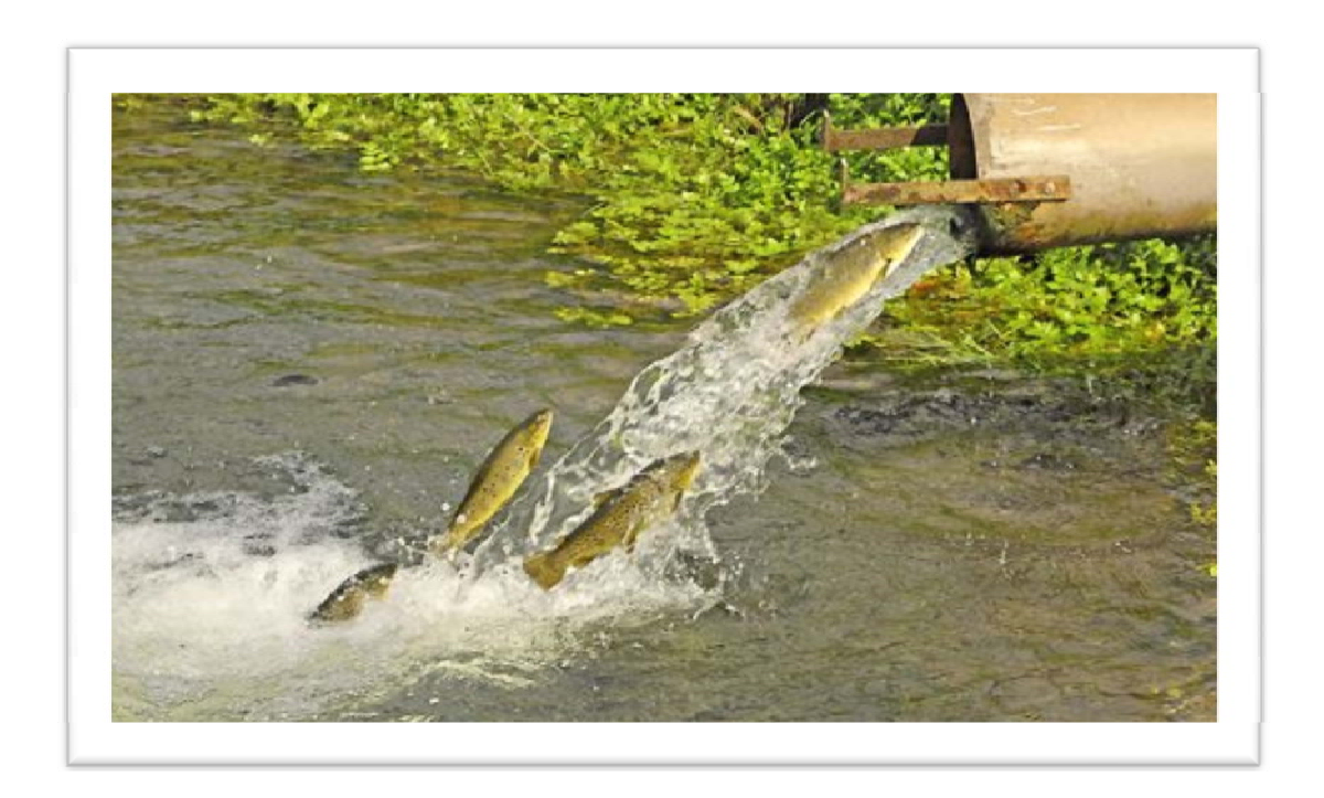
Swimming Up "Crap" Creek